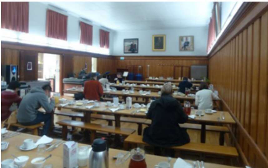
— Upper Hall

An alternative to Upper Hall in the evenings is Formal Hall; a typical ‘Cambridge’ experience which runs every day except Saturday and consists of a three course meal. Formal Hall is a great way to get everyone from College together for a special event, such as birthdays. Diners wear gowns and Fellows also eat here, at the High Table. Eating in Formal Hall costs £6.80 , reflecting the higher quality of food as well as setting and atmosphere. To attend Formal Hall you must book in via the College Intranet by 12pm on the day before you wish to eat, or if it is a Sunday then by 12pm on the Friday preceding. Water is the only drink provided so you are expected to bring any wine or soft drinks with you. There is a ‘limit’ of half a bottle of wine per person, and you are liable to a £1 corkage fine if this has not been bought from the Buttery. For higher prices, you also have the option of steak or high table meals, ensuring a higher quality of food. College members may invite up to two guests to Formal Hall on any night, at a charge of £8.30 per person to your card bill. If you wish to bring more guests you can do so with tutorial permission, or invite a friend from College along and use their guest allowance too.