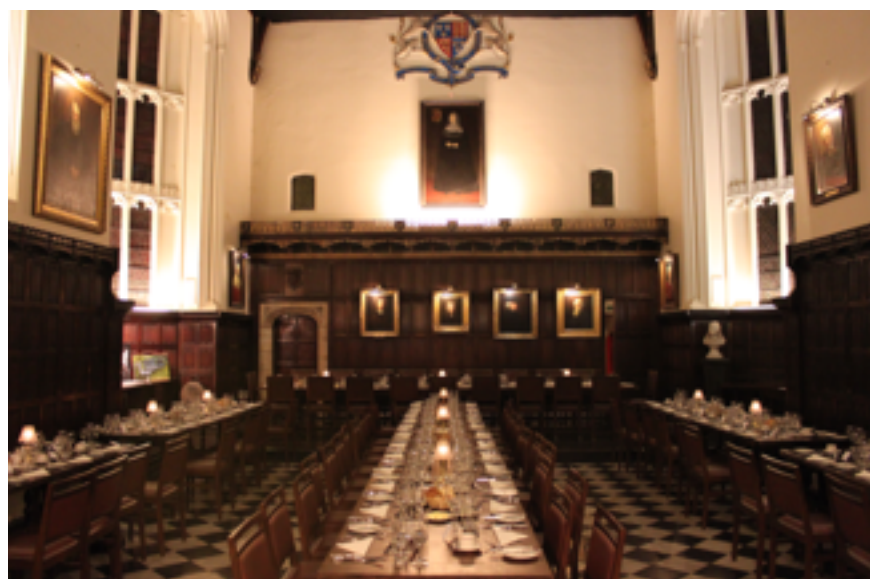
Formal Hall —